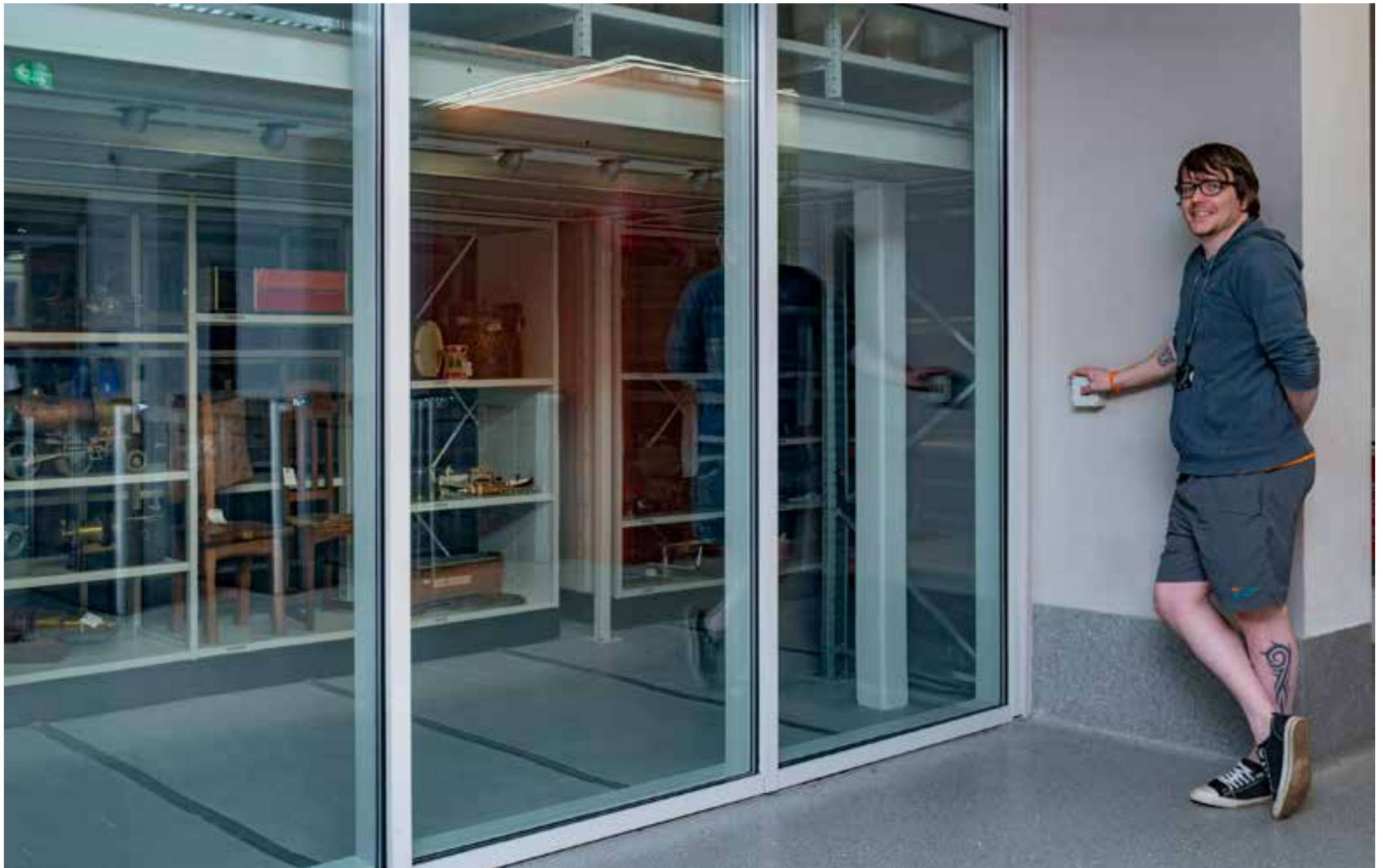
There is a museum store room. You can push the button to light up the window display.