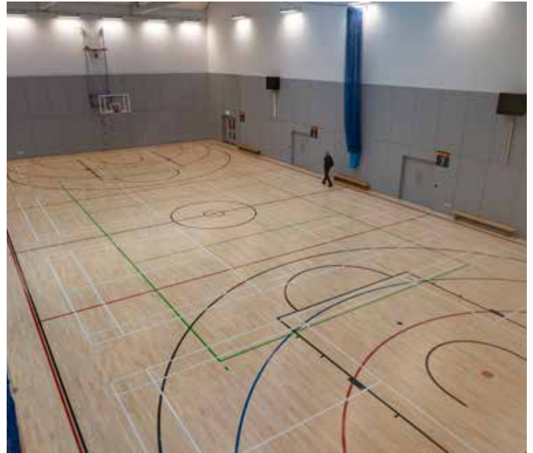
This is the sports hall.