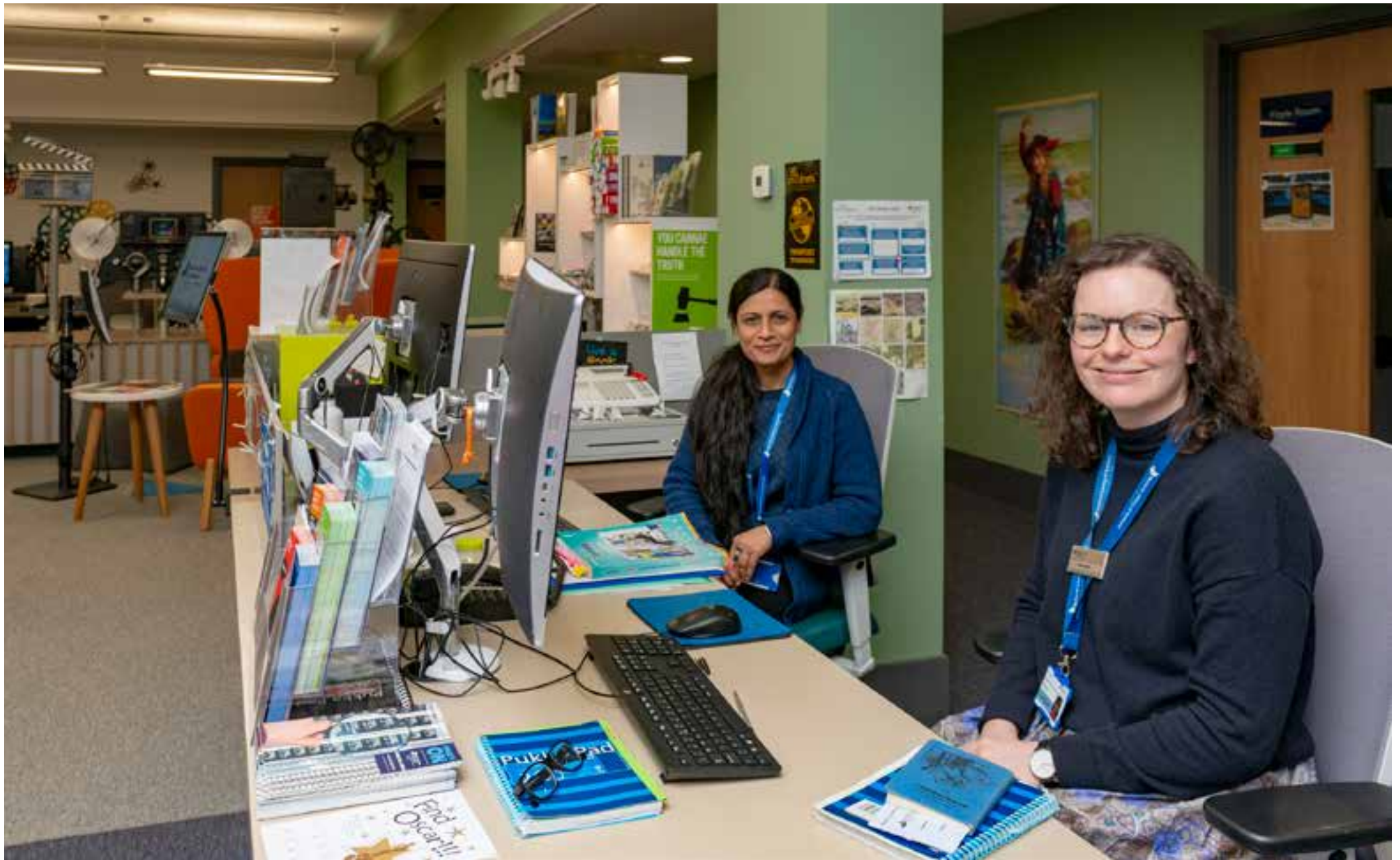
This is the National Library of Scotland's Moving Image Archive. You do not need to pay. Staff can help you if you ask. Library staff all wear a blue lanyard.