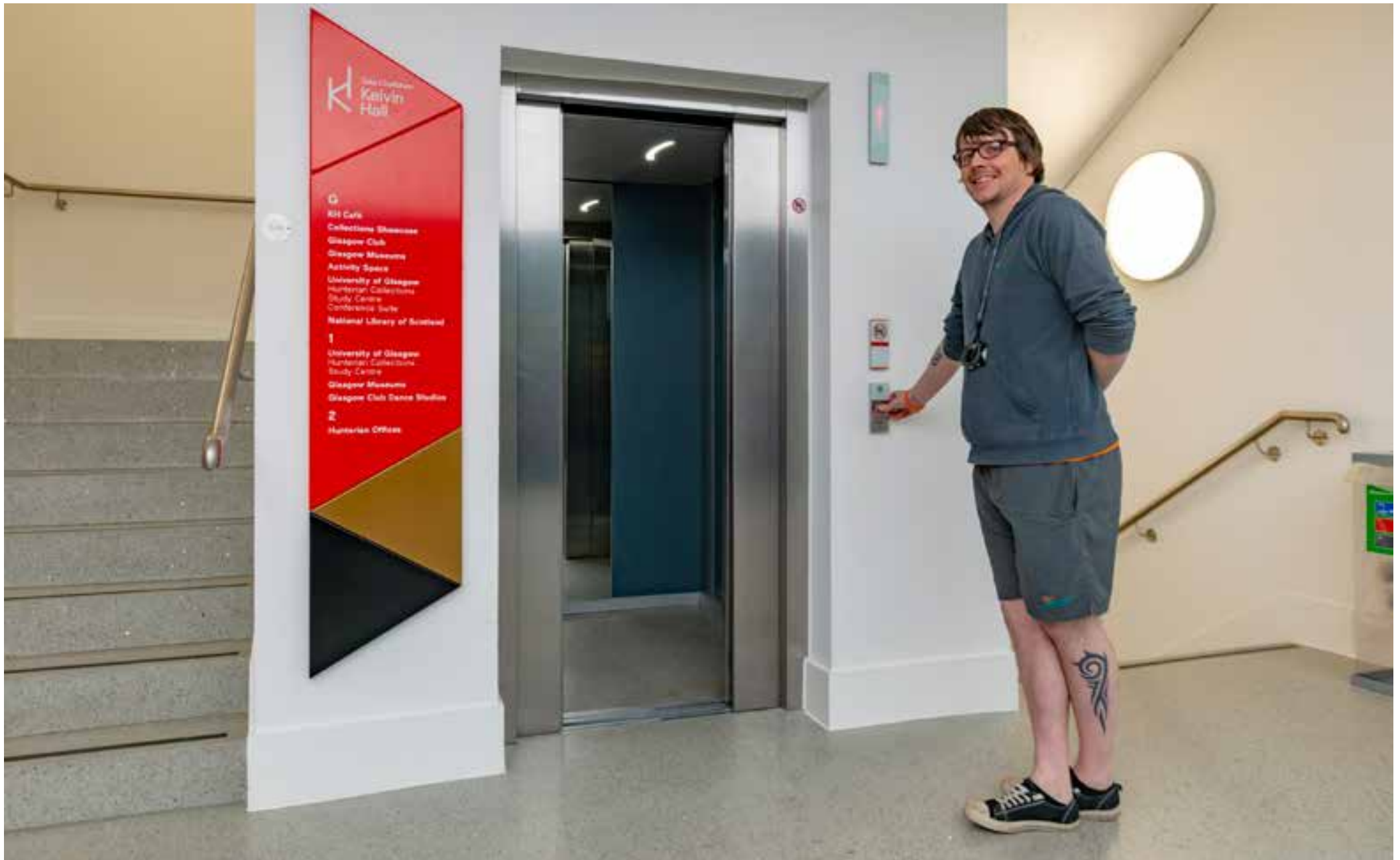
There are stairs. There are lifts.