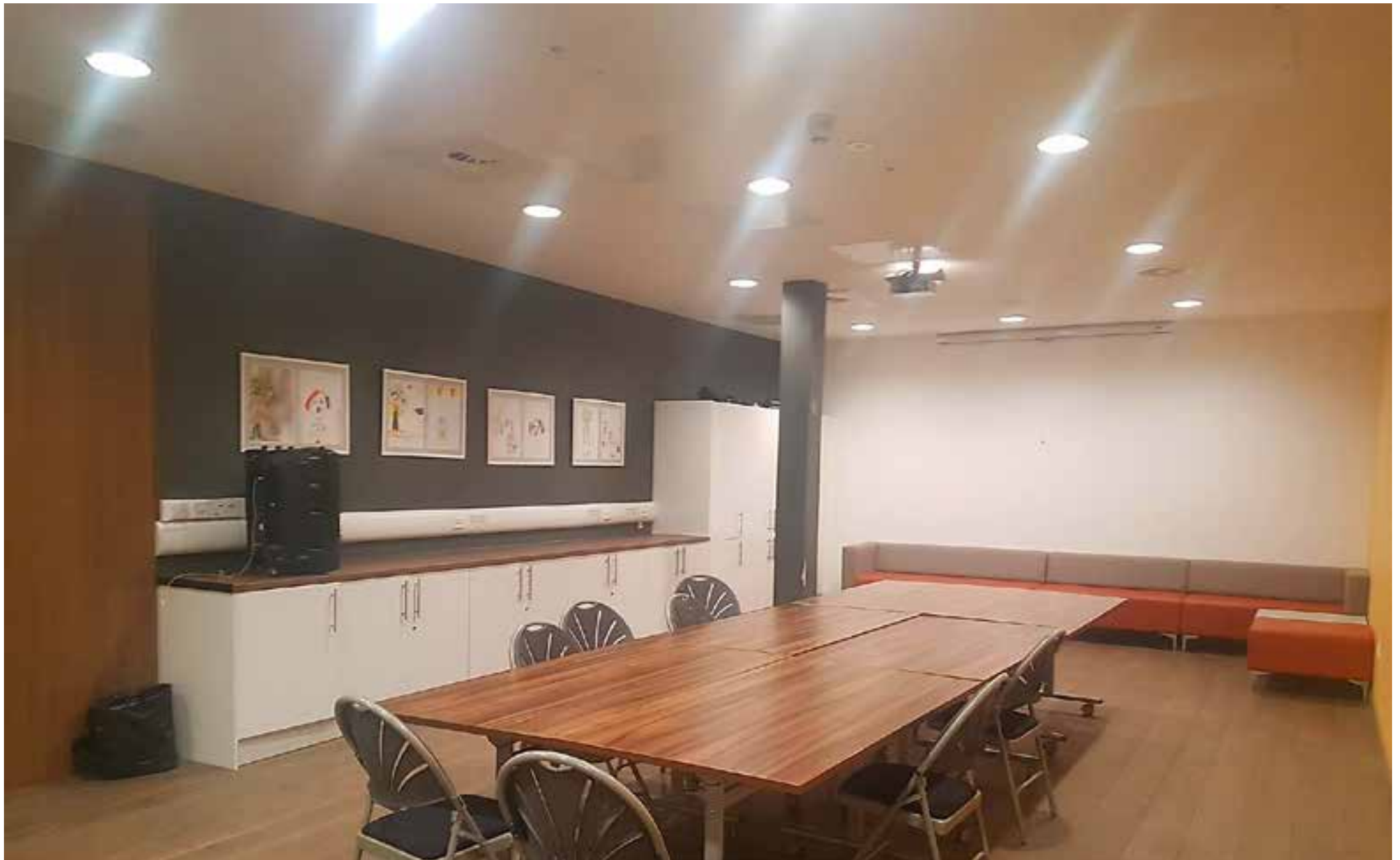
This is the activity space. Schools visit this space with a learning assistant. Sometimes this space is closed.