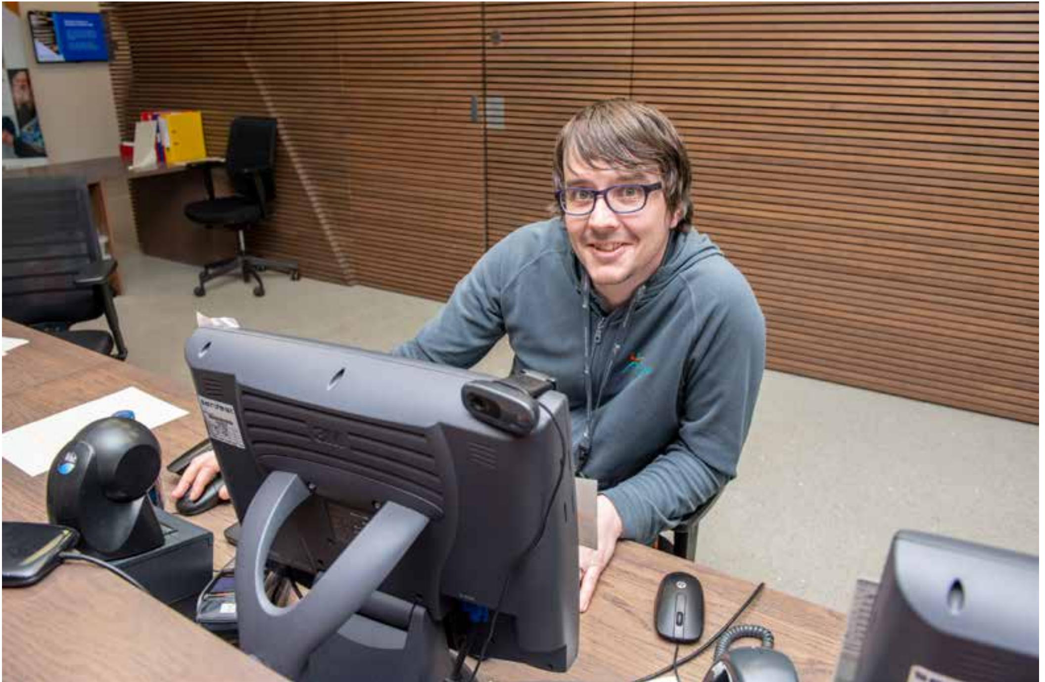
The reception is straight ahead. A Glasgow Life Assistant can help you if you ask.