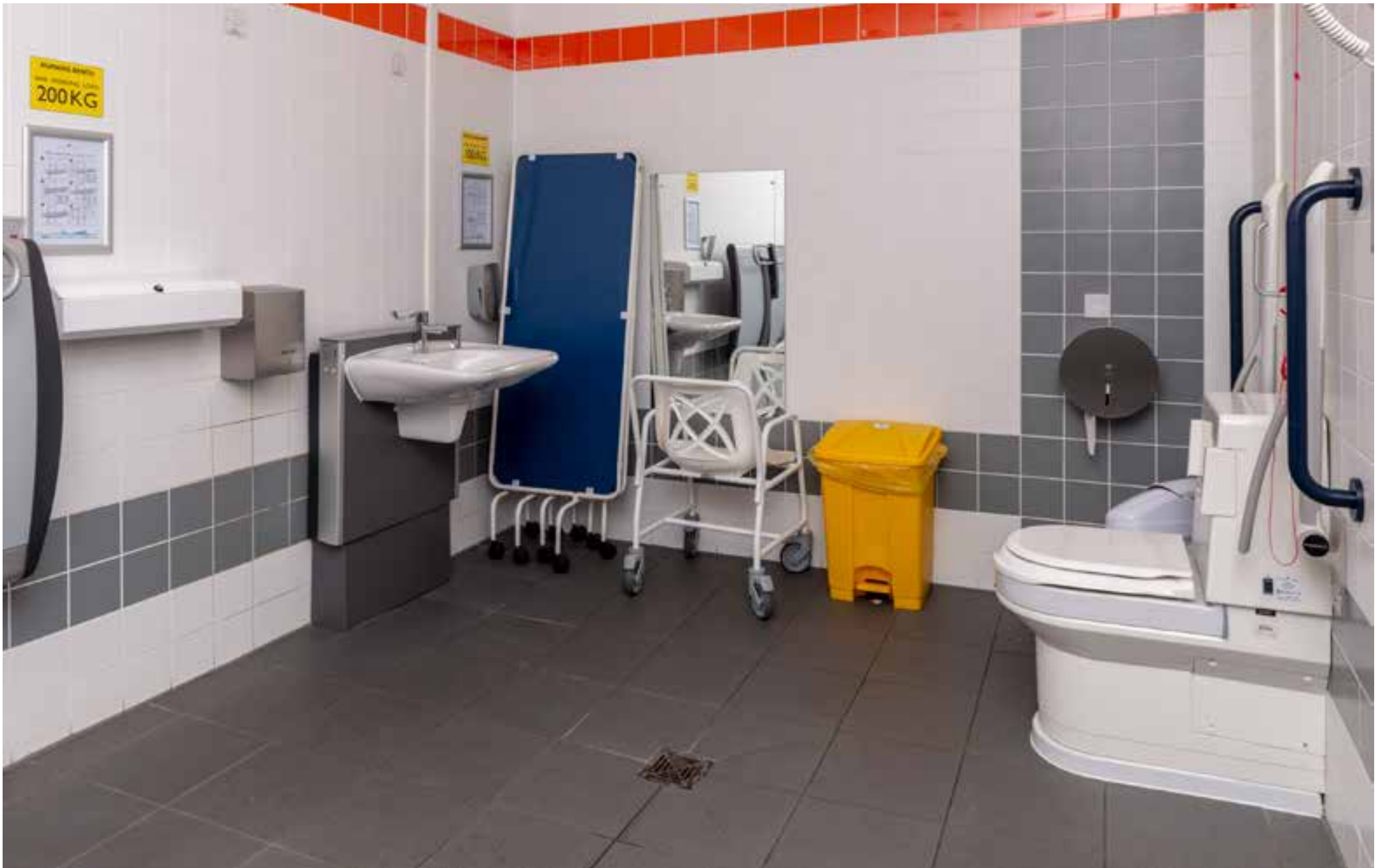
There are Changing Places facilities.