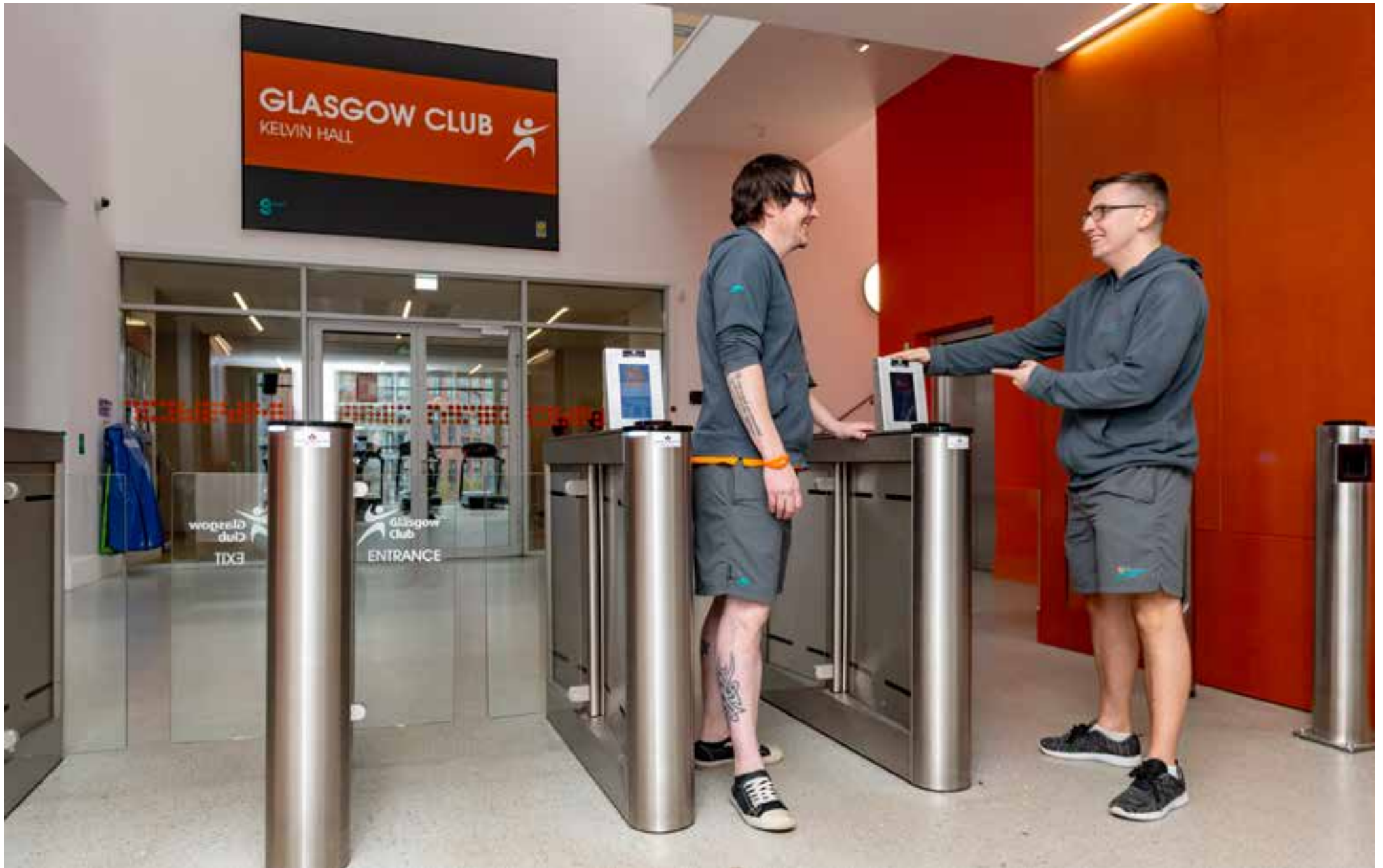
You can enter the gym here. A Glasgow Life Assistant will be nearby to help you.