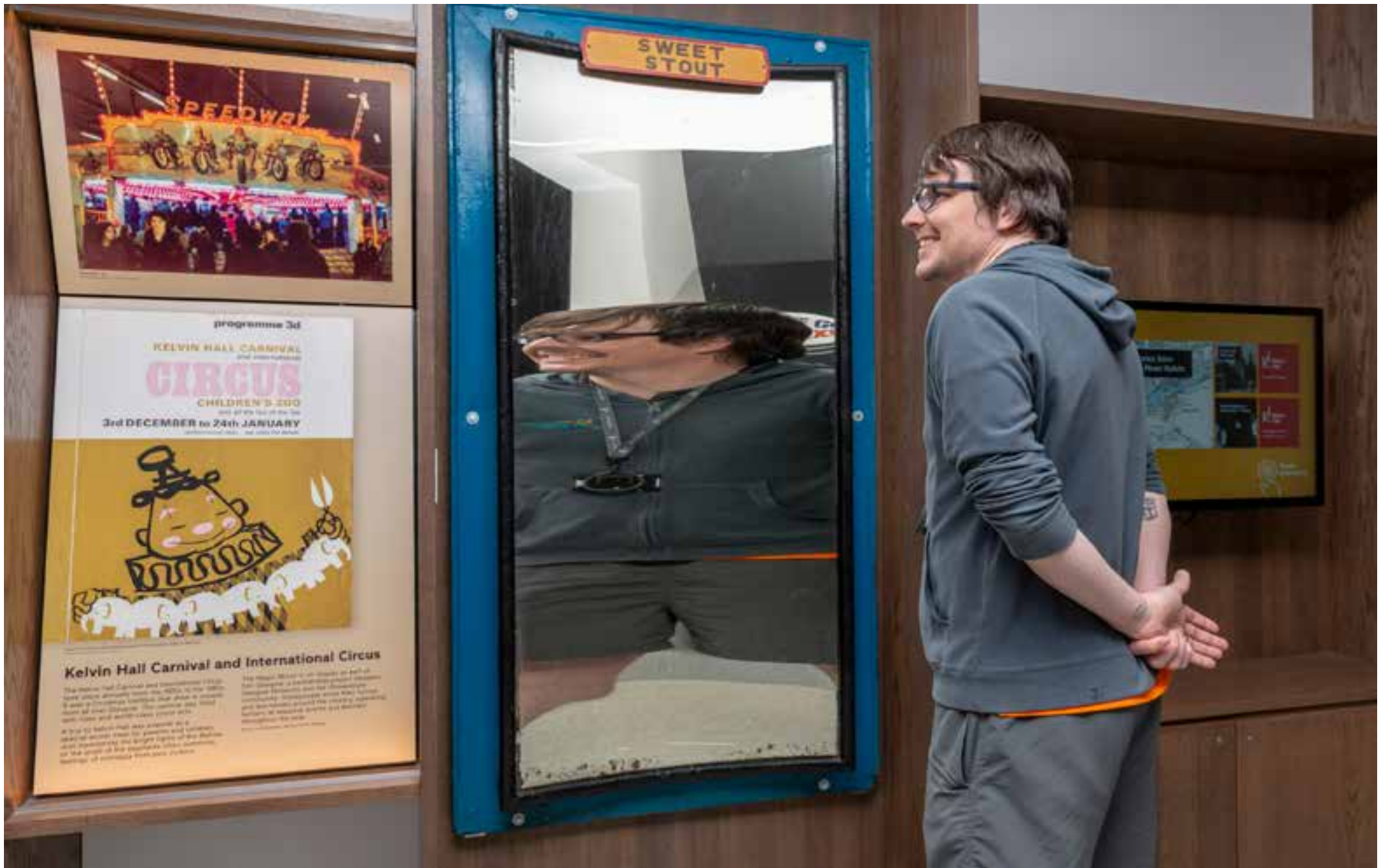
There is a fairground mirror.