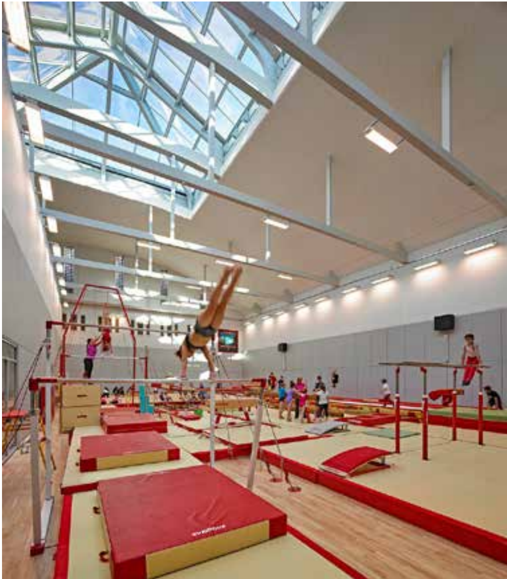
This is the gymnastics hall.