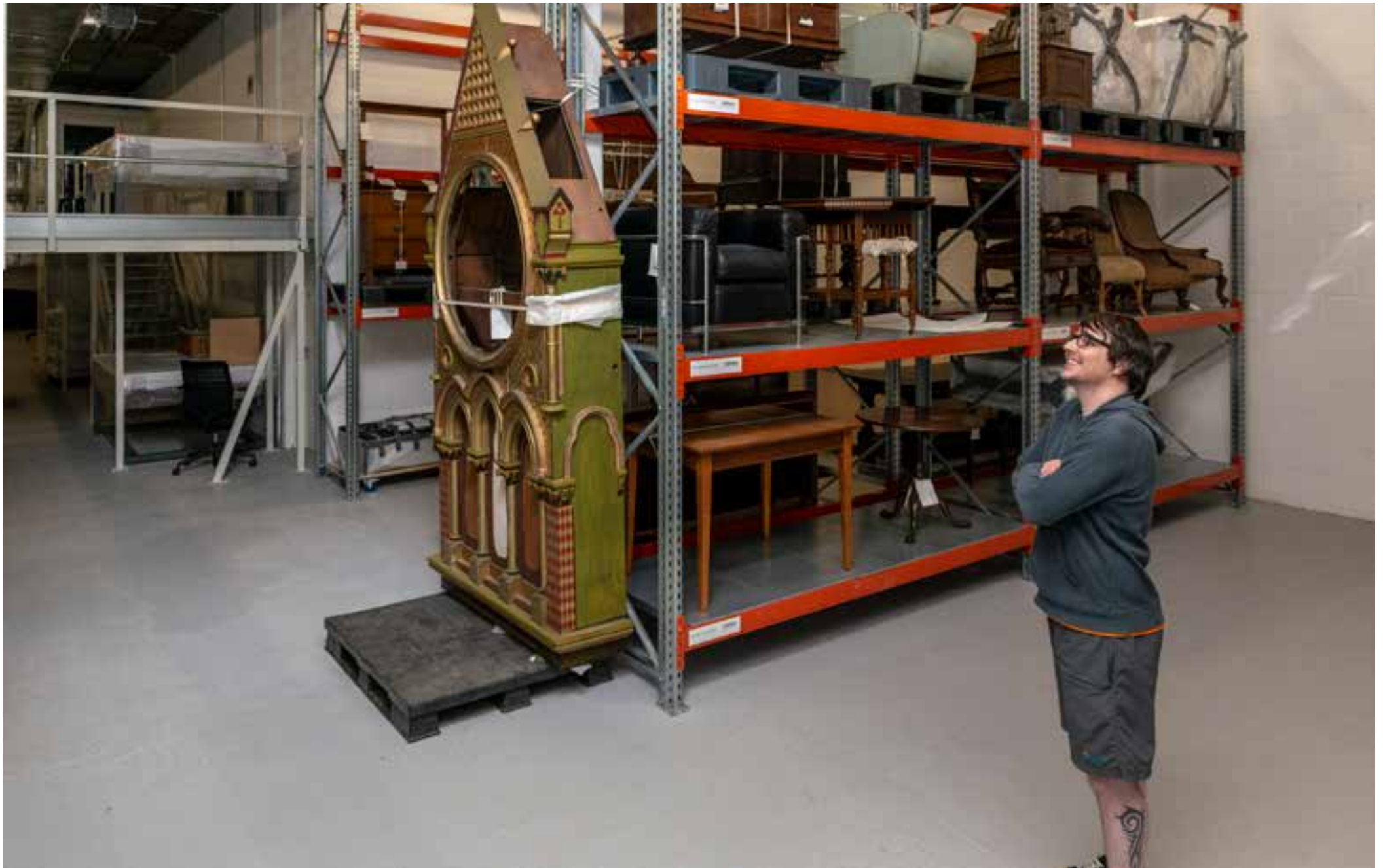
Schools visit this space with a learning assistant. Sometimes this space is closed.