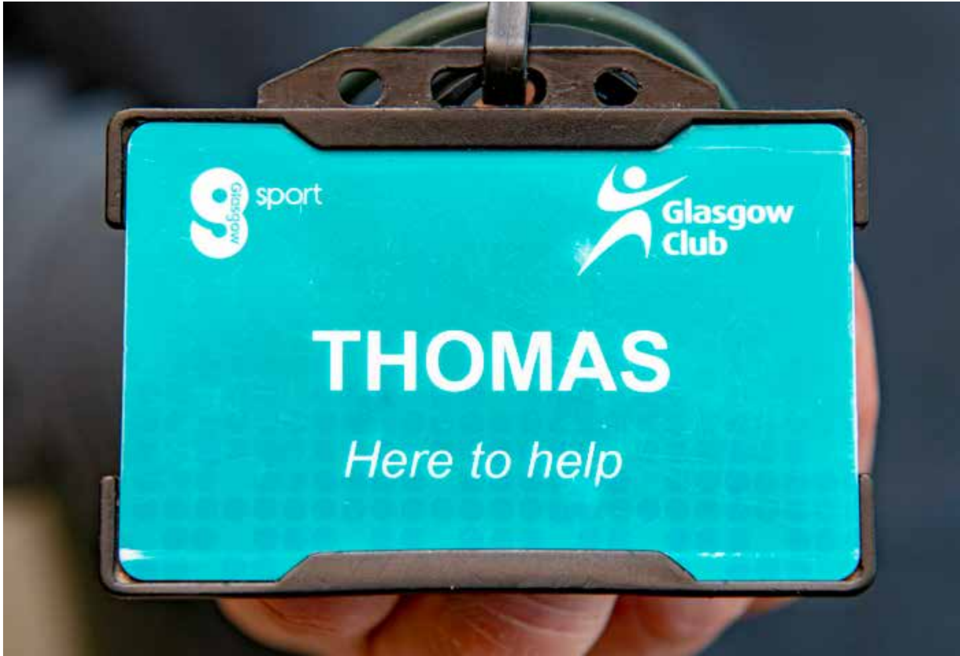
Staff all wear a 'g' logo.