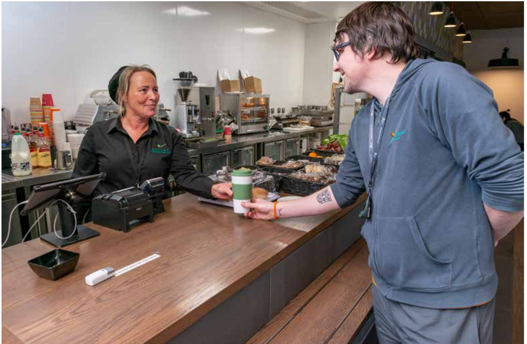
The Kelvin Hall Café is to your left. You can queue up to buy sandwiches and coffee here.