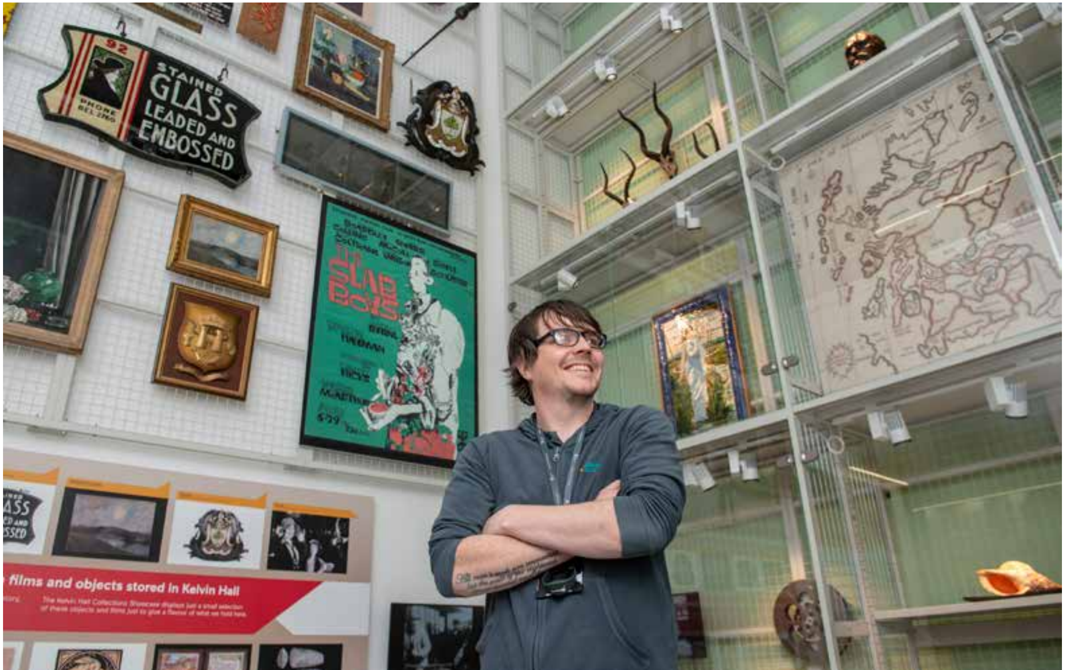
You can look at museum objects and paintings.