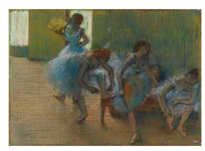
Dancers on a Bench by Edward Degas

Pupils will be introduced to a wonderful selection of Impressionist works on display. They will learn about the well-known artists associated with this movement, the techniques they used and have a chance to experiment with a selection of materials to create their own Impressionist-inspired artworks. They will also be introduced to art and design terminology to support critical studies.